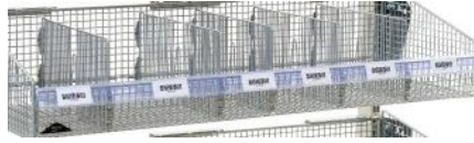
QB36LHC Clear Label Holder (shown with labels)