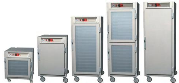
Under Counter Full Clear Door 1/2 Height Full Solid Door 3/4 Height Full Clear Door Full Height Dutch Clear Doors Full Height Full Solid Door