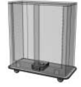
Standard Electric Thermal System