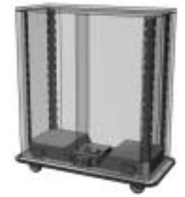
Quad-Heat<sup>™</sup> Dual Fuel Thermal System