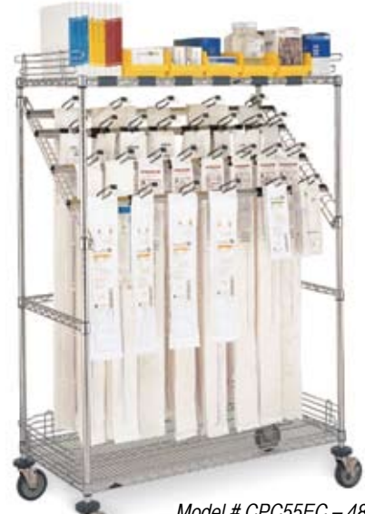
Model # CPC55EC - 48" (1219mm) bars shown Model # CPC56EC - 60" (1524mm) bars