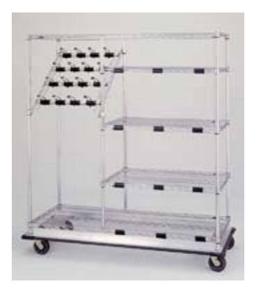
Model # CPC3/2LC - Standard Combination Style with 36" (910mm) bars and 24" (610mm) shelves