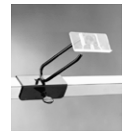
Close-up of Catheter Hook on Bar Assembly