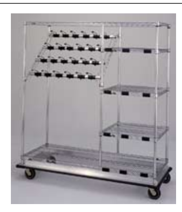
Model # CPC2/3LC - Standard Combination Style with 24" (610mm) bars and 36" (910mm) shelves