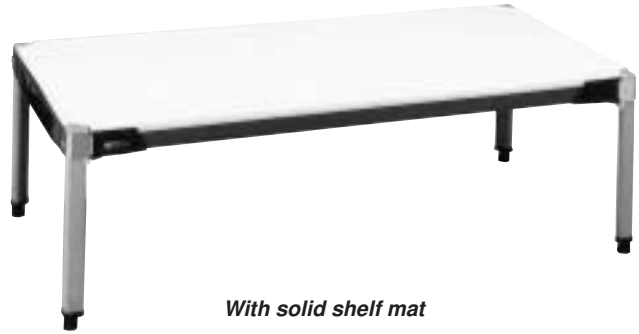
With solid shelf mat