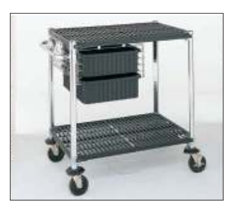
QESD Utility Cart (shown with optional accessories)

• Handles — available in 18" or 24" widths. Type 304 stainless steel. Includes two (2) conductive tri-lobal adapters to attach handle to the posts.