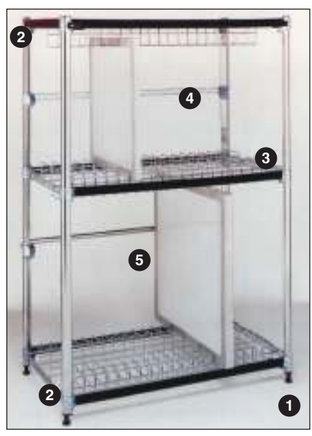
MQN546CSTL (shown with optional accessories)

*Note: As part of the improved MetroMax iQ Storage System, minor dimensional changes were made to the MetroMax Q ESD shelves, stencil storage levels and backstops, reel storage levels, adjustable slanted shelves, and utility cart handles. Unless otherwise noted, these items are not compatible on MetroMax Q ESD units manufactured prior to May, 2009.