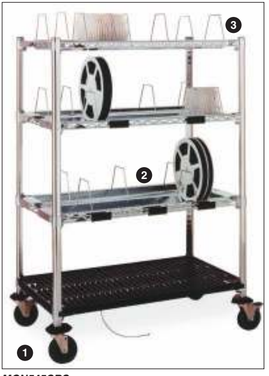
MQN545CRS (shown with optional accessories)

*Note: As part of the improved MetroMax iQ Storage System, minor dimensional changes were made to the MetroMax Q ESD shelves, stencil storage levels and backstops, reel storage levels, adjustable slanted shelves, and utility cart handles. Unless otherwise noted, these items are not compatible on MetroMax Q ESD units manufactured prior to May, 2009.