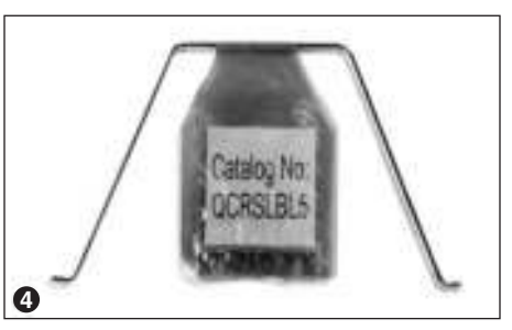
QCRSLBL5 (shown with divider)