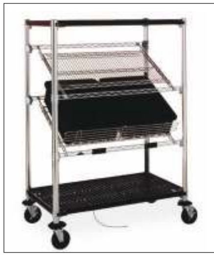
MQ2442AS (shown above as part of a complete cart)

*Note: As part of the improved MetroMax iQ Storage System, minor dimensional changes were made to the MetroMax Q ESD shelves, stencil storage levels and backstops, reel storage levels, adjustable slanted shelves, and utility cart handles. Unless otherwise noted, these items are not compatible on MetroMax Q ESD units manufactured prior to May, 2009.