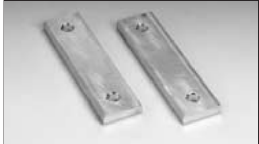
Top-Track Wall Mount Brackets