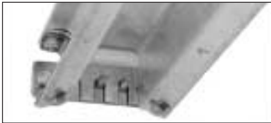
Illustration of both the Top-Track Wall Mount Bracket Kit and Stop Kit