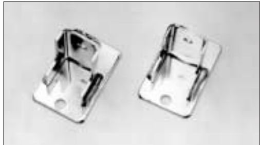
Top-Track Stop Plate Kit