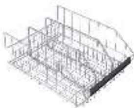
IVB1 (Dividers sold separately)