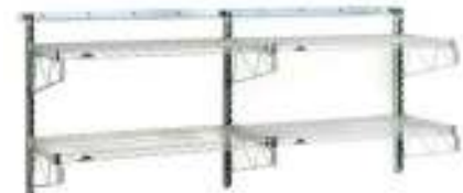
Adjacent units with a shared upright