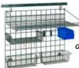
Grid and grid shelf