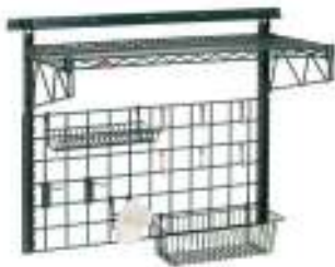
Task Station (medium duty) with accessories for a sink/prep area.