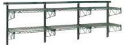
Adjustable Wall Shelving