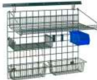
Task Station (standard duty) with accessories for a food prep area.