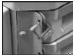
Close security seal.