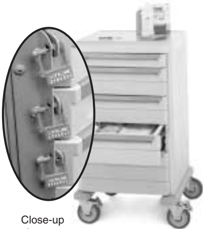
Close-up of system