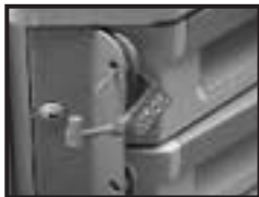
Insert security seal.