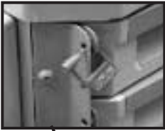
Close-up of tab.