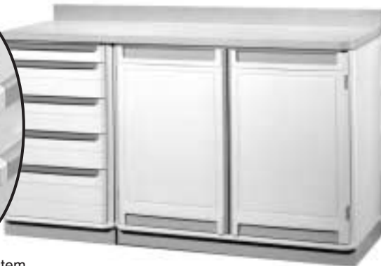
SX36WC14 Shown with SXPSLK-30.