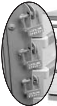
Close-up of system