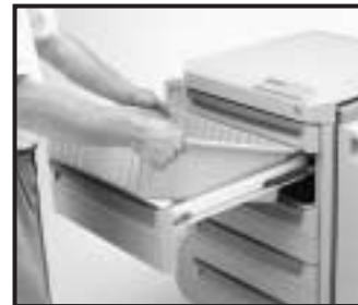
Removable totes allow instant replenishment.

Available in three nominal heights: 30", 33" & 36" (762 mm, 838mm, & 914mm).