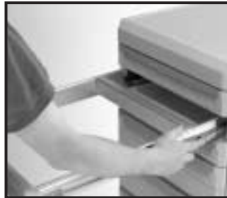
Reconfigure without tools.