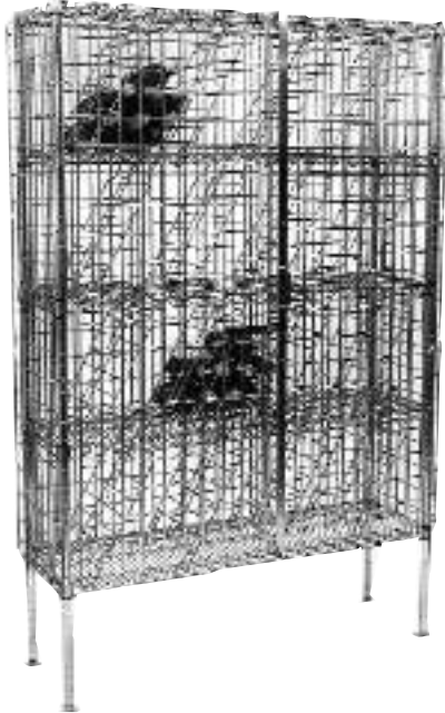
Model WB257C with Door Accessory