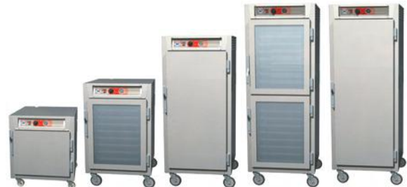
Under Counter Full Solid Door 1/2 Height Full Clear Door 3/4 Height Full Solid Door Full Height Dutch Clear Doors Full Height Full Solid Door