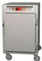
1/2 Height Solid Doors