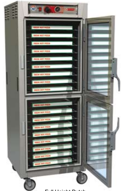
Full Height Dutch Clear Doors