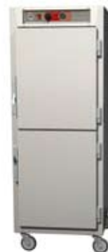
Full Height Dutch Solid Doors

Note: Add an "A" to the end of the cabinet part number when ordering accessories.