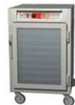
1/2 Height Clear Doors