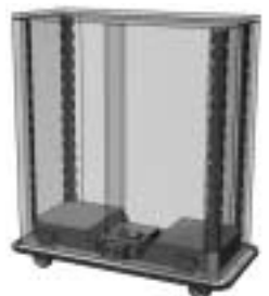
Quad-Heat™ Dual Fuel Thermal System