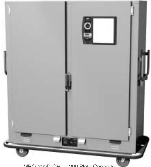
MBQ-200D-QH — 200 Plate Capacity with Quad-Heat™ Dual Fuel