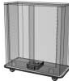
Standard Electric Thermal System