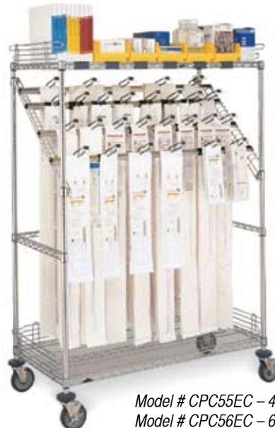
Model # CPC55EC – 48" (1219mm) bars shown Model # CPC56EC – 60" (1524mm) bars