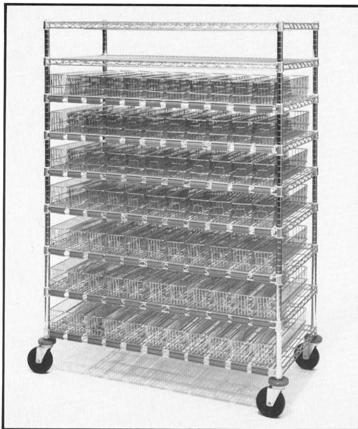
Catheter Cart with Catheter Baskets