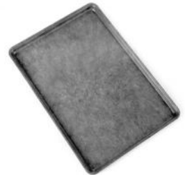
Static dissipative tray (CBTC – TRAYS D)