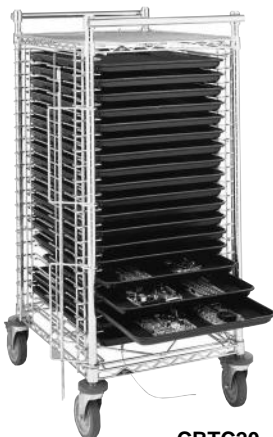
CBTC20 Ergonomic design.