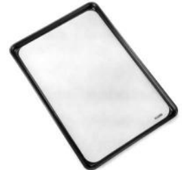
Conductive tray (CBTC – TRAY) with inlay (CBTC – INLAY01)