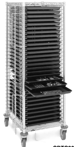
CBTC30 Offers greatest capacity.