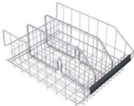
IBV1 (Dividers sold separately)