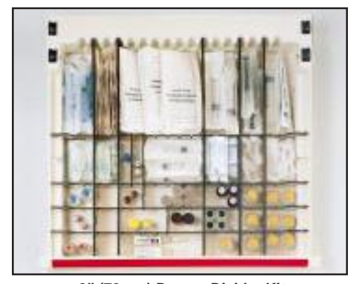
3" (76mm) Drawer Divider Kit MF113

MetroFlex<sup>™</sup> drawer label strips identify cart application, drawer contents, and more. Select from eight designer colors. Label strips come in packs of eight. Red will be shipped unless another color is specified.