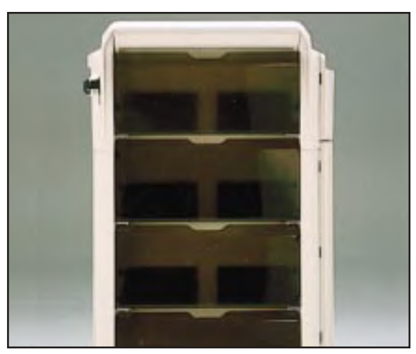
Recessed Area with Tilt-Out Bins