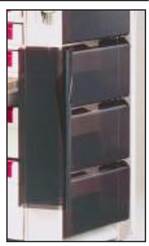
MF214 MF230 MF235 MF240