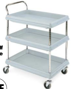
3-Shelf Deep Ledge