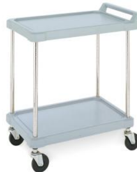
2-Shelf BC Series Flat