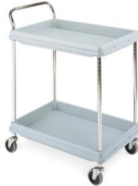
2-Shelf Deep Ledge