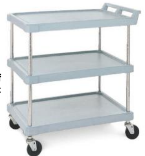
3-Shelf BC Series Flat

Specifications: Utility cart consisting of at least 2 polyethylene, injection-molded shelves containing Microban® antimicrobial product protection, chrome-plated posts or handle. 2-shelf cart may accept an intermediate shelf if necessary. Cart has four 4" (102mm) diameter, resilient rubber swivel stem casters. Cart rated at 150 lbs. (65kg) capacity per shelf, 400 lbs. (180kg) per unit.