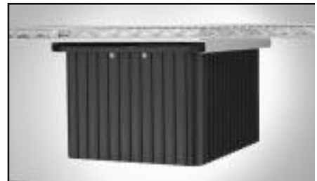
One-Piece Slide (tote sold separately)