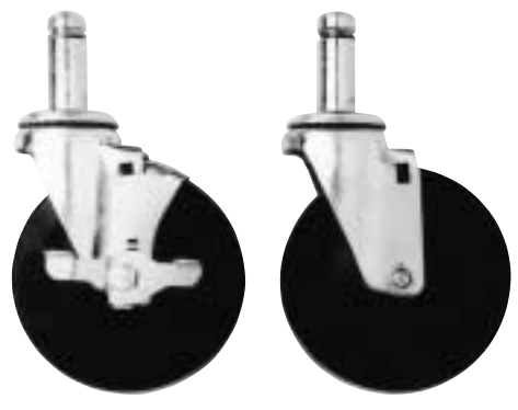
5MB Wheel Brake Includes Donut Bumper (not shown)