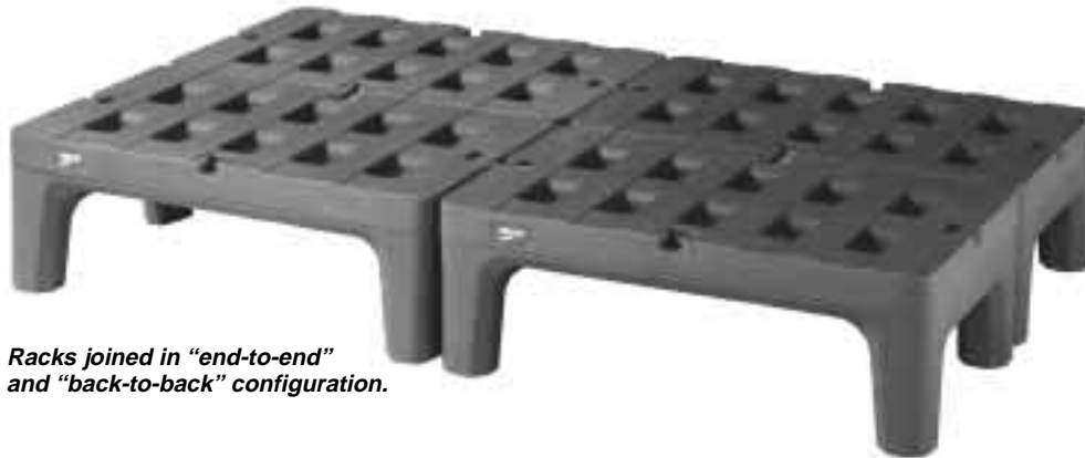
Racks joined in “end-to-end” and “back-to-back” configuration.