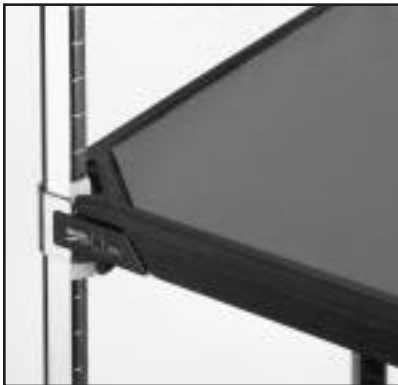
MetroMax Q ESD Inlay