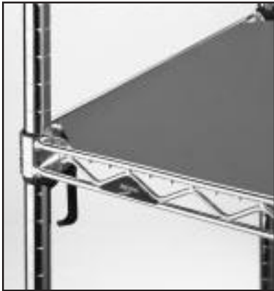
Super Adjustable ESD Inlay