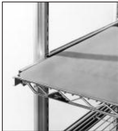
ESD Open Starsys Inlay

ESD Shelf Inlays: ESD Shelf Inlays are the perfect complement to Metro's open wire shelving products in any electronics production environment. Convert your Metro shelf or wire cart into a "soft" solid surface for added protection of your most sensitive and abrasion-prone housings and subassemblies. Consider some of the following benefits: