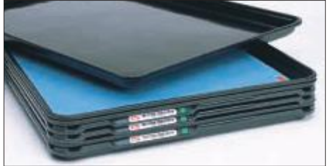
SmartTray™ features barcoding and color coding, and stacks with other trays of the same footprint.

Put the SmartTray advantage to work for you!