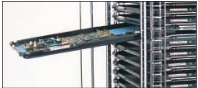
SmartTray™ engages with wire cart design to provide optimum ergonomic access.