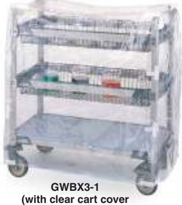
(with clear cart cover and casters)