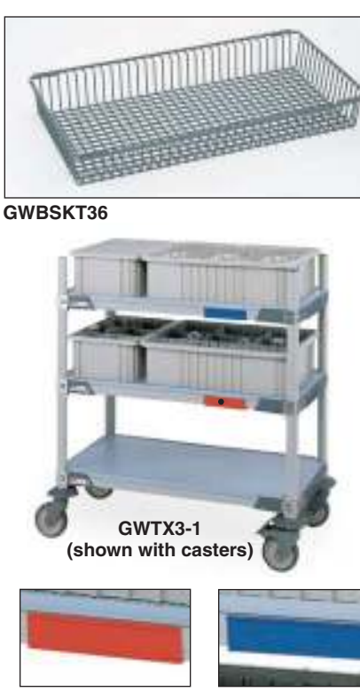
Red shelf markers can be used to designate unclean glassware