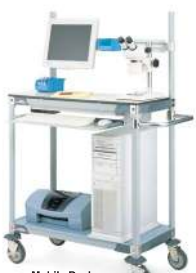
Mobile Desk Cat. No. MDSX3 (Casters included)

Metro's Lab Cart line includes a General Lab Cart, Chemical Cart, and Mobile Desk. All carts are designed to offer superior corrosion resistance. Smooth rolling, 5" (127mm) polyurethane casters come standard with each cart. All shelves adjust in 1" (25mm) increments, offering precise shelf adjustment and maximum storage utilization.