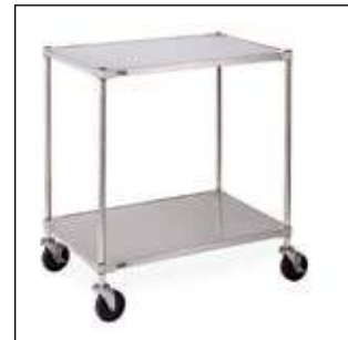
LC2S1824 (casters ordered separately)

Note: To build a lab cart according to specific requirements, follow instructions (D) on page 7. Refer to Autoclave guidelines, below, for important checklist to follow.