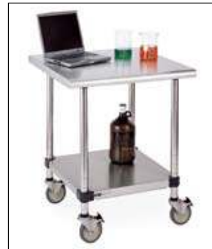
LTSM30IS with casters