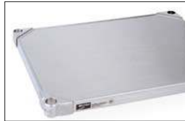
All stainless solid shelf with stainless corners