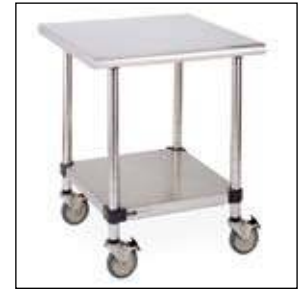
LTSM30IS with casters (ordered separately)

Stainless Lab Tables are load rated at 50 lbs. per sq. foot (.024kg per sq. cm) up to a maximum of 600 lbs. (273kg) assuming evenly distributed load and caster specification meets requirement.