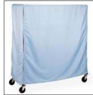
LC5S2460 with autoclave cart cover (casters ordered separately)

Note: Autoclave cart covers are rated for approximately 70 cycles per cover.