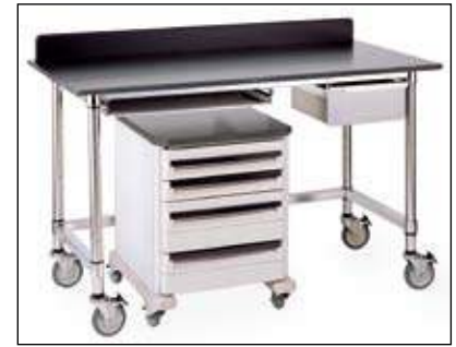
LTSM60UPB with accessories, casters, backsplash accessory, and Starsys™ cart

Stainless Lab Tables are load rated at 50 lbs. per sq. foot (.024kg per sq. cm) up to a maximum of 600 lbs. (273kg) assuming evenly distributed load and caster specification meets requirement.