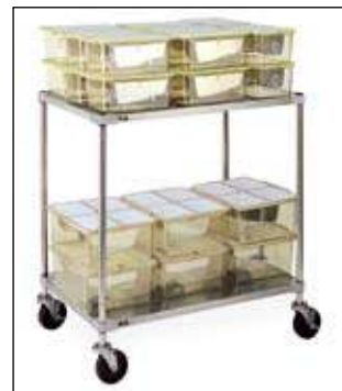
LC2S2436 with autoclave casters