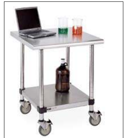
LTSM30IS with casters