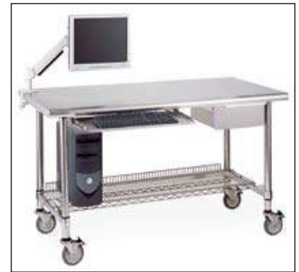
LTSM60UIS with accessories and casters

Stainless Lab Tables are load rated at 50 lbs. per sq. foot (.024kg per sq. cm) up to a maximum of 600 lbs. (273kg) assuming evenly distributed load and caster specification meets requirement.