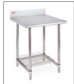
LTS30US with accessory wire shelf

Stainless Lab Tables are load rated at 50 lbs. per sq. foot (.024kg per sq. cm) up to a maximum of 600 lbs. (273kg) assuming evenly distributed load and caster specification meets requirement.