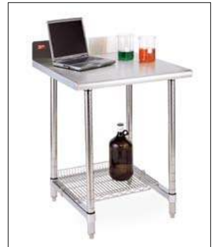
LT30US with accessory stainless wire shelf

Epoxy resin: Epoxy resins, silica, organic fillers, and inert hardeners are cast in forms and cured to a uniform mixture throughout.