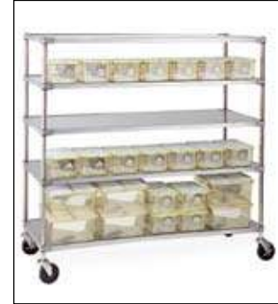
LC5S2460 (casters ordered separately)

Note: To build a cage rack according to specific requirements, follow instructions (D) on page 7. Refer to Autoclave guidelines, below, for important checklist to follow