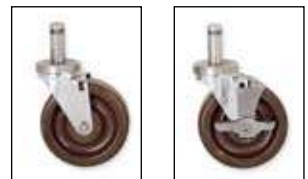
5MHTP and 5MHTPB (Hi-temp phenolic autoclave casters)