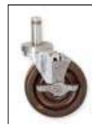
5MHTP & 5MHTPB