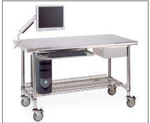
LTSM60UIS with accessories and casters