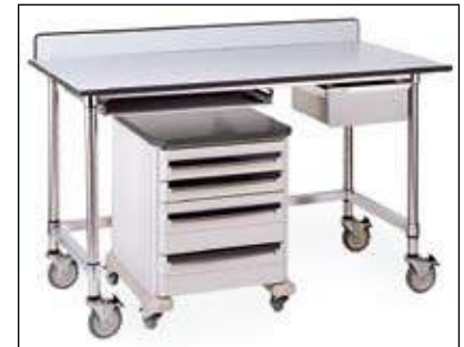
LTSM60UPG with accessories, casters, backsplash accessory, and Starsys™ cart

Stainless Lab Tables are load rated at 50 lbs. per sq. foot (.024kg per sq. cm) up to a maximum of 600 lbs. (273kg) assuming evenly distributed load and caster specification meets requirement.