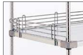
4" (101mm) Ledges

*Actual ledge length is approximately 1" (25mm) shorter than nominal shelf length/width.