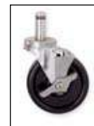
5MHTN & 5MHTNB