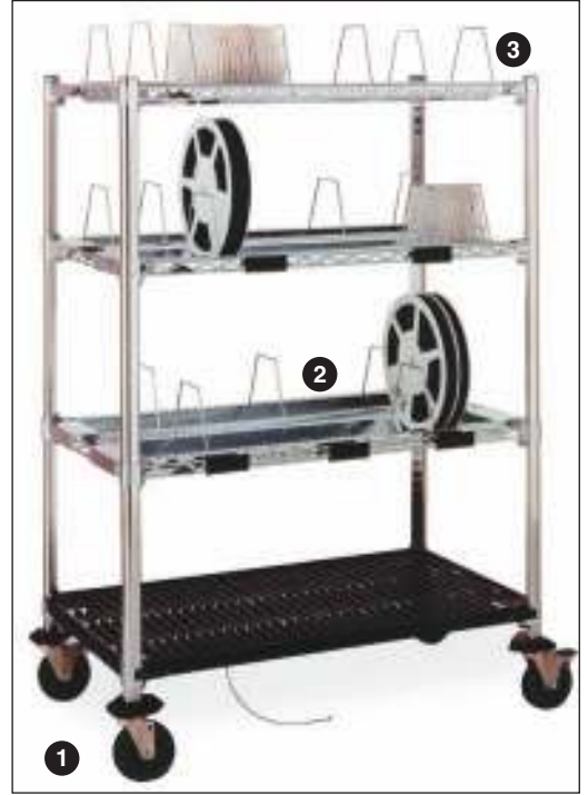
MQN545CRS (shown with optional accessories)

*Note: As part of the improved MetroMax iQ Storage System, minor dimensional changes were made to the MetroMax Q ESD shelves, stencil storage levels and backstops, reel storage levels, adjustable slanted shelves, and utility cart handles. Unless otherwise noted, these items are not compatible on MetroMax Q ESD units manufactured prior to May, 2009.