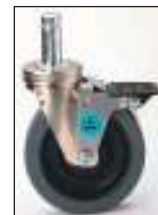
Q5MBESD Non-Marking Conductive Brake Caster