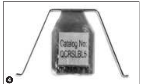
QCRSLBL5 (shown with divider)