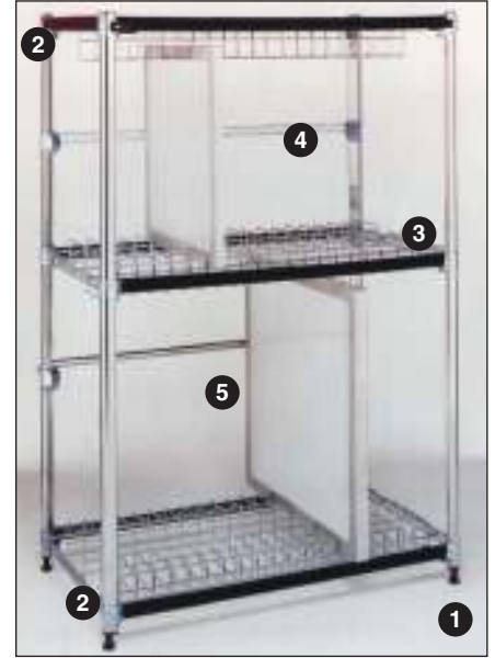
MQN546CSTL (shown with optional accessories)

*Note: As part of the improved MetroMax iQ Storage System, minor dimensional changes were made to the MetroMax Q ESD shelves, stencil storage levels and backstops, reel storage levels, adjustable slanted shelves, and utility cart handles. Unless otherwise noted, these items are not compatible on MetroMax Q ESD units manufactured prior to May, 2009.