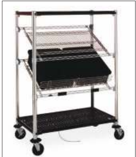
MQ2442AS (shown above as part of a complete cart)

*Note: As part of the improved MetroMax iQ Storage System, minor dimensional changes were made to the MetroMax Q ESD shelves, stencil storage levels and backstops, reel storage levels, adjustable slanted shelves, and utility cart handles. Unless otherwise noted, these items are not compatible on MetroMax Q ESD units manufactured prior to May, 2009.