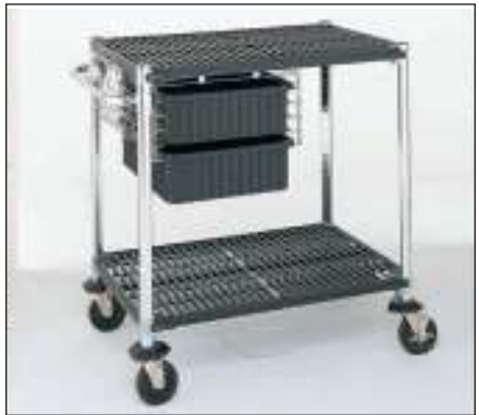
QESD Utility Cart (shown with optional accessories)

*Each utility cart includes 2 shelves, 4 posts (33"), one grounding cable, one handle, two swivel casters (5MDXAs) and two brake casters (5MDBXAs).