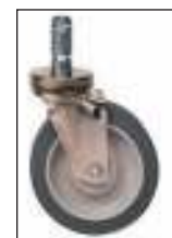
Q5MFA Vibration Suppression Caster