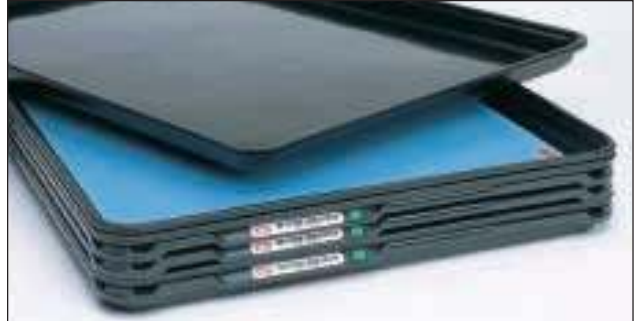
SmartTray™ features barcoding and color coding, and stacks with other trays of the same footprint.

Put the SmartTray advantage to work for you!