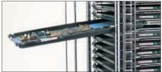
SmartTray™ engages with wire cart design to provide optimum ergonomic access.