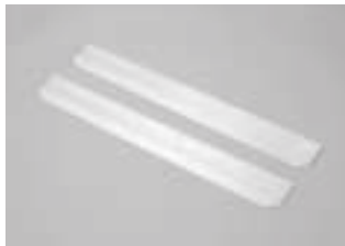
3" (76mm) Tote Long Divider