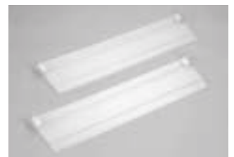
7" (178mm) Basket Long Divider