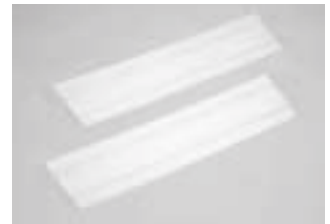
6" / 9" (152/229mm) Tote Long Divider