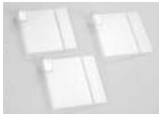
6" / 9" (152/229mm) Tote Short Divider