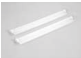
3" (76mm) Basket Long Divider