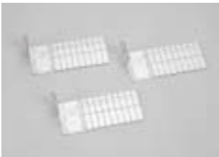
3" (76mm) Tote Short Divider