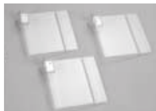
7" (178mm) Basket Short Divider