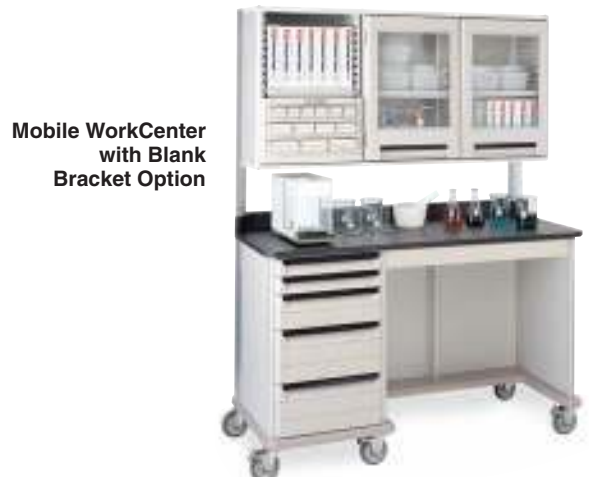
Mobile WorkCenter with Blank Bracket Option