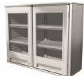
Double-Wide Overhead Cabinet with Polymer Shelves and Locking, Clear Door