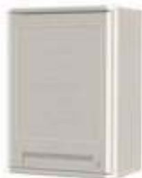
Single-Wide Overhead Cabinet with Solid Door