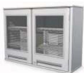
Double-Wide Overhead Cabinet with Wire Shelves (2) and Locking, Clear Door