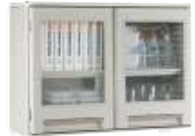
Double-Wide Overhead Cabinet shown with Clear Doors