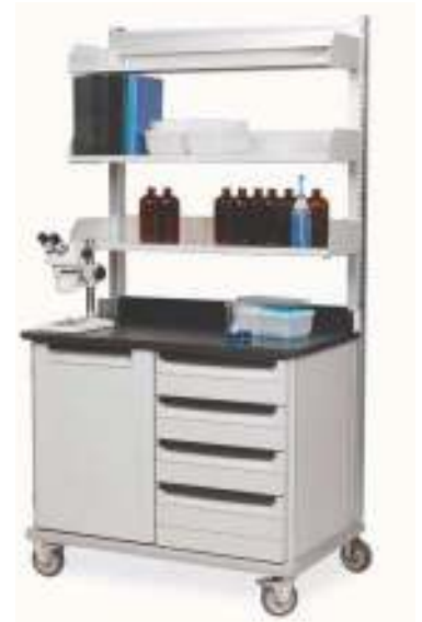
Mobile WorkCenter with Reagent Shelving

Contact the Metro Starsys team for dimension and packaged weight information.