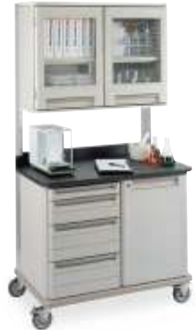
Mobile WorkCenter with Epoxy Top