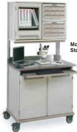
Mobile WorkCenter with Stainless Steel Top