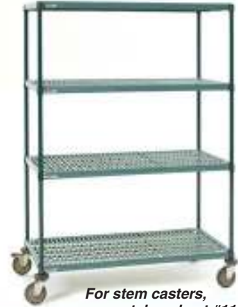
For stem casters, see catalog sheet #11.20

NOTE: Not suitable for cart wash applications.