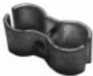
POST CLAMP Cat. No. 9994Z