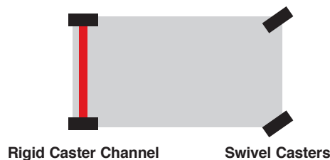
Rigid Caster Channel