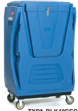
TXPA-BLK48SEC Bulk truck, with enclosures

Gate and Lid: (option for bulk truck) Molded polymer construction with Microban® antimicrobial product protection, with stainless steel hinges, latch and hardware. Color: Medium Blue