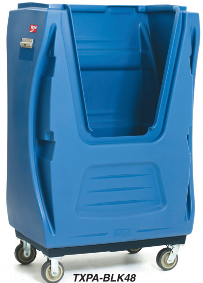
TXPA-BLK48 Bulk truck, with no enclosures

*Microban® antimicrobial protection inhibits the growth of stain and odor-causing bacteria, keeping the surface areas “cleaner between cleanings.”