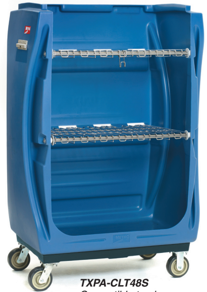
TXPA-CLT48S Convertible truck